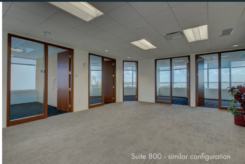
Suite 800 - similar configuration

Full floor in Class A Office Tower Multiple configurations available